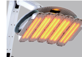
830 nm with 590 nm photosequencing

With three available treatment heads, there is one that is right for your treatment needs. Ask your doctor which Healite II wavelength is right for you.